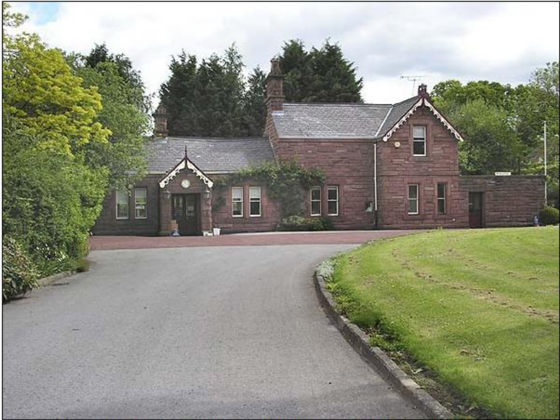
Malpas station forecourt seen from the station approach road in May 2006. Many of the original station features including the clock have been preserved.