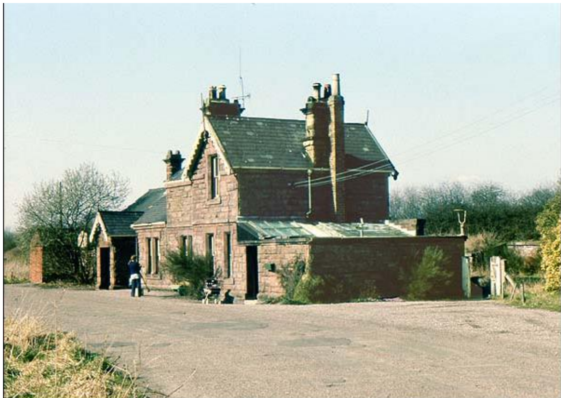
Malpas station forecourt in April 1978