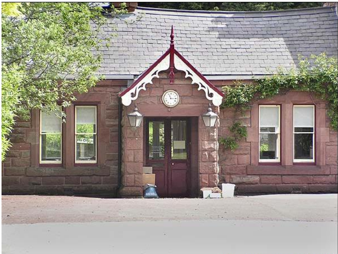
Malpas station entrance in May 2006