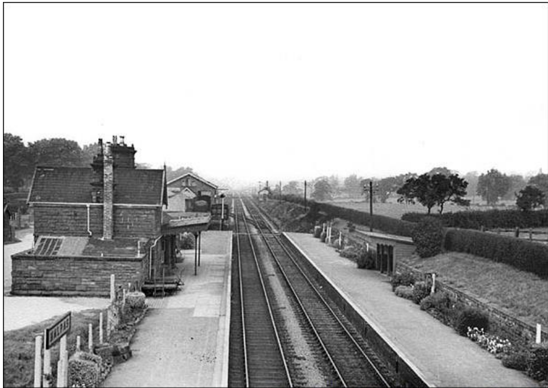
Malpas Station looking north in the early 20th century