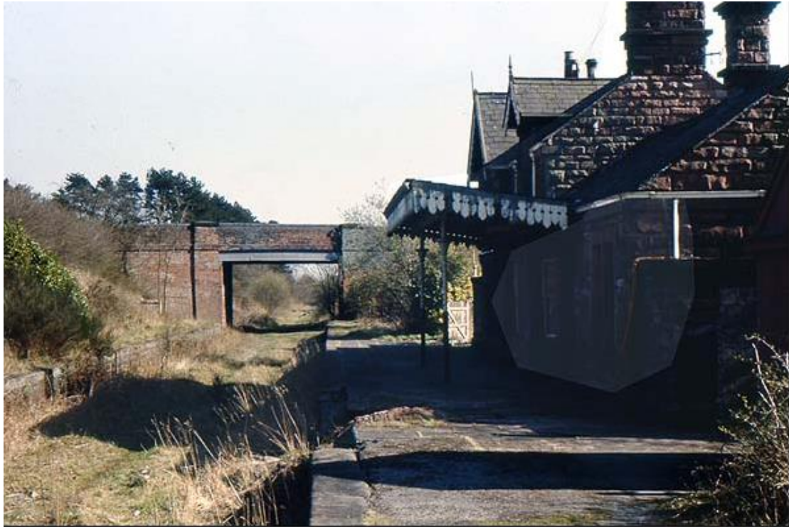
Malpas Station looking south in April 1978