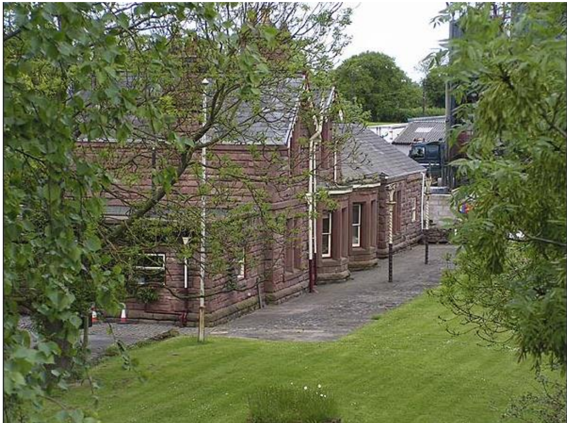
Malpas Station in May 2006. Part of the platform is still extant and the supporting columns for the station canopy can clearly be seen.