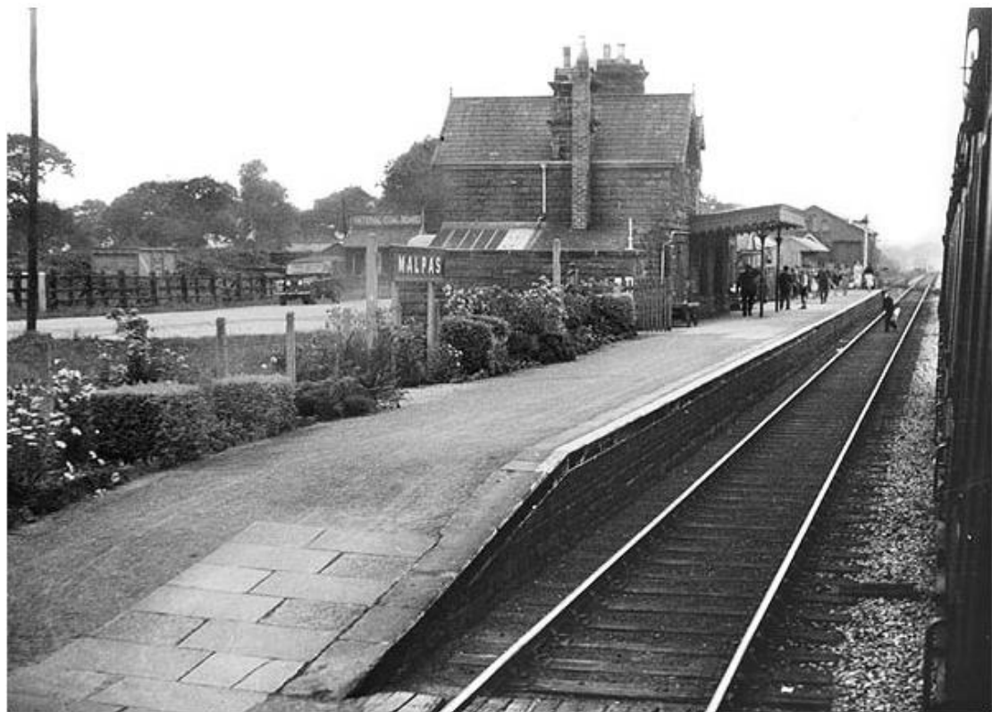
Malpas Station looking north in August 1954