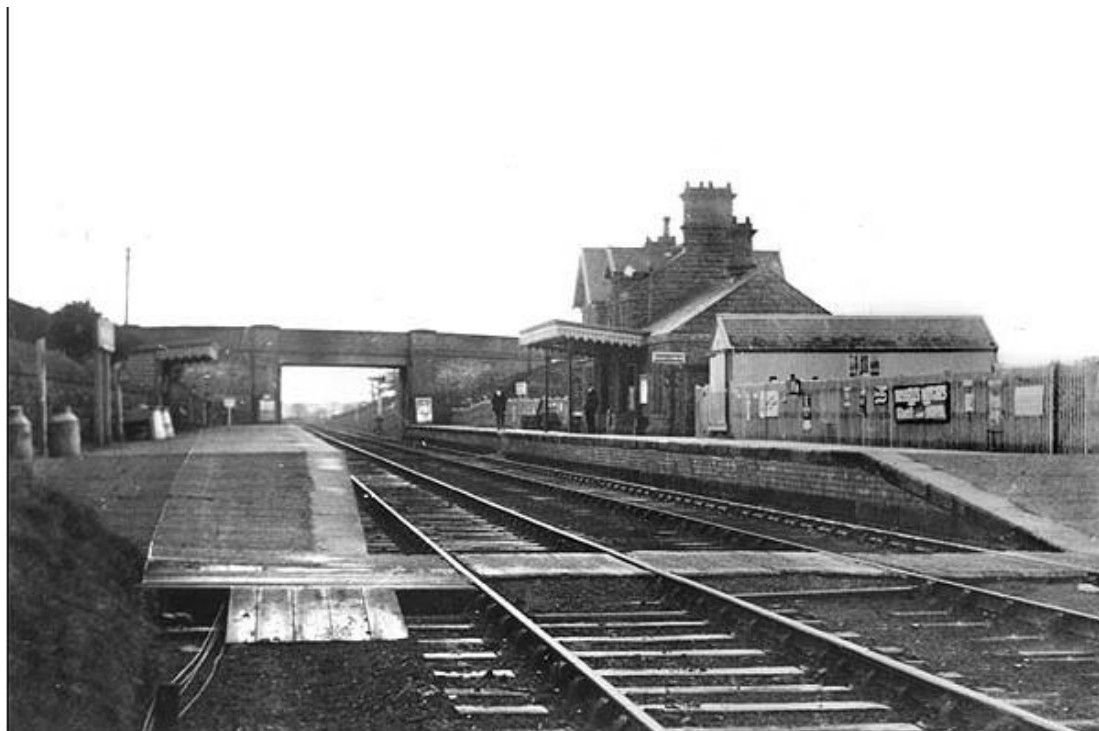
Malpas Station looking south